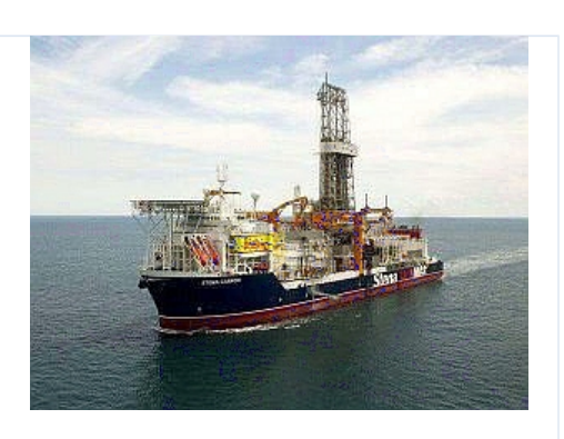
The Stena Carron drillship has moved back to the Liza area to drill the Liza-4 well.

The announcement would come days after top officials and experts in the field of oil and gas journeyed to Guyana to participate in a major conference which was hosted in the nation's capital, Georgetown.