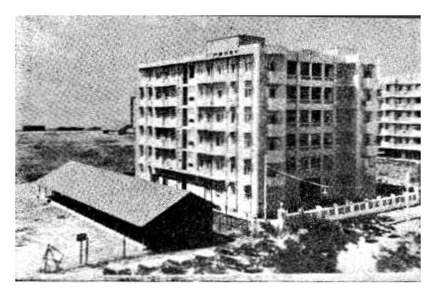
Modern flats - Bombay