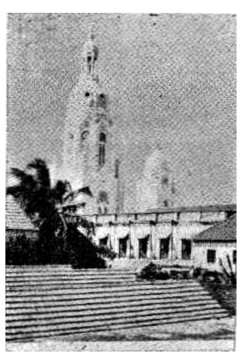
Catholic Cathedral - Madras