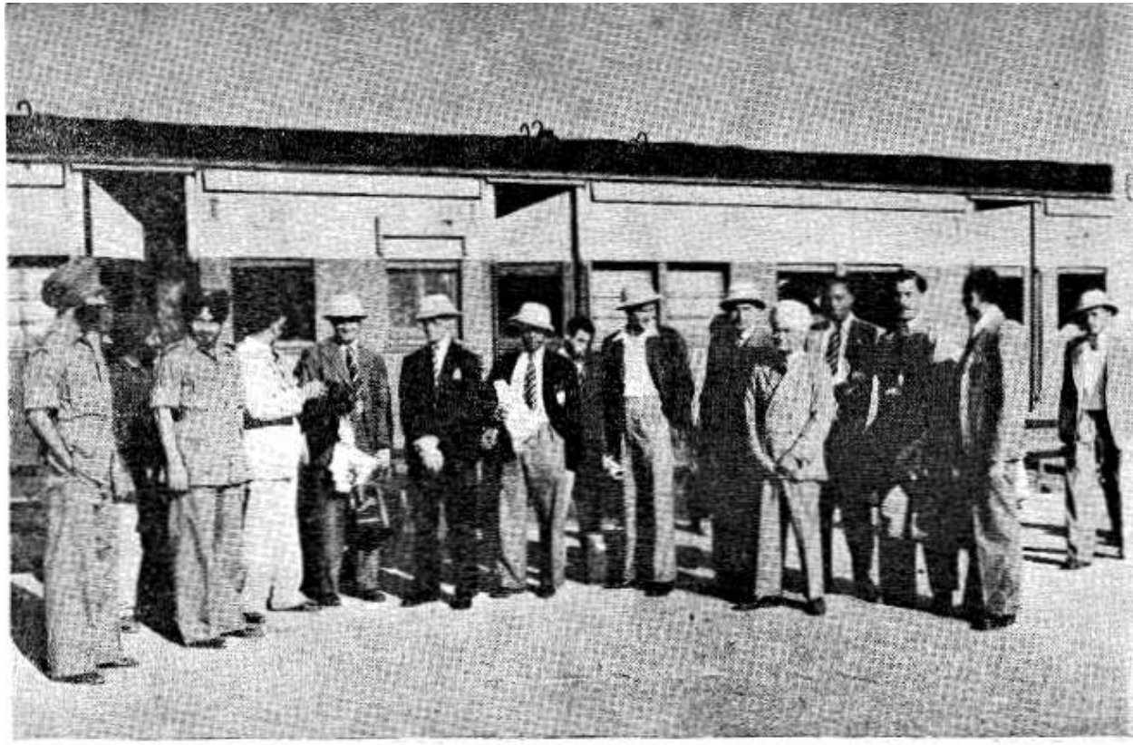
Various Modes of Transport in India