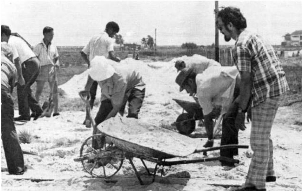
Headmaster, Staff and Association Members lend a hand on the Farm.

The work of the Farm Committee is one that seems to have no end. The empoldering, fencing, digging of drains, construction of a caretaker's house, laboratory, chicken pens, and animal pens, as well as the planting of rice, sugar cane and a wide variety of fruits and vegetables, not to mention fish culture, these have been going on and will continue for some time to come. One of the most encouraging aspects of the Farm Project, and one that augurs well for the future, has been the self-help that has been forthcoming. Every Sunday since the first Sunday of May, has brought together at the farm, dozens of parents and students, old boys, friends and supporters who have worked in the blazing sun or drenching rain so as to construct chicken pen No. 2. and the animal pen. This represents not only a saving of cash, but the involvement of the Guyanese community in a project with which they are proud to be associated. Involvement breeds further involvement, and we hope and pray that this self-help will continue for many years to come, and so transform the entire face of our Nation. For we sincerely believe that our Co-operative Republic, based on the principle of working and sharing and building together - one people, one nation, one destiny - will eventually confound its critics who seem to preach nothing but failure and discontent.