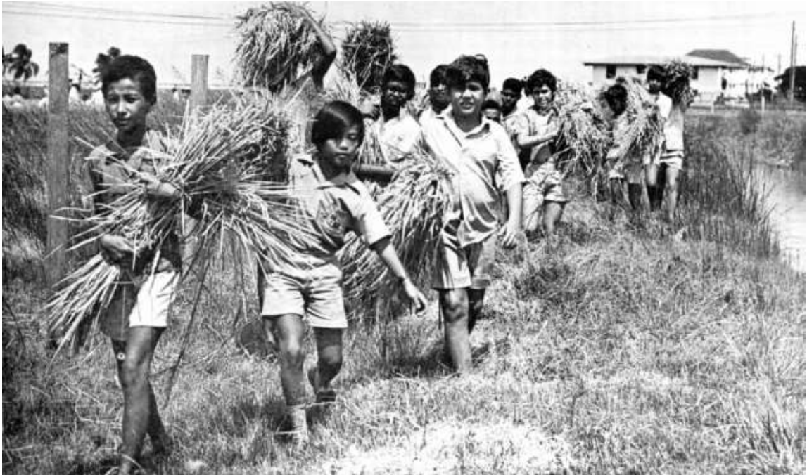
First Formers bring in the first crop of rice from the College Farm.

The Hymn to St. Stanislaus rings out from the marquee. Yes, that is the new St. Stanislaus College on the Farm. God is good. "Bless Yahweh, my soul. Yahweh my God, how great you are. You make fresh grass grow for cattle and those plants made use of by man, for them to get food from the soil." The Farm is officially open.